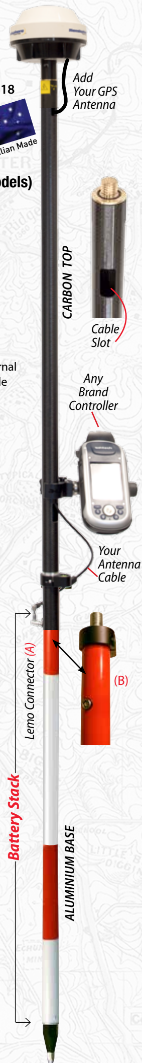
Model GT-PP-AL Removeable Batteries