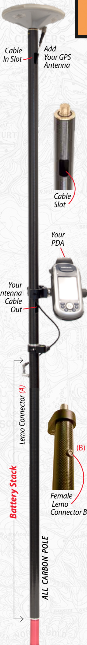
Model GT-PP Non Removeable Batteries

sales@UAS-Australia.com.au www.UAS-Australia.com.au